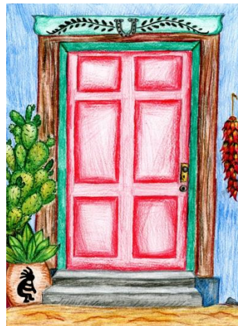
Serena Hsu's drawing.