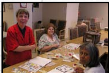
Residents of St. Luke's Home work on their albums