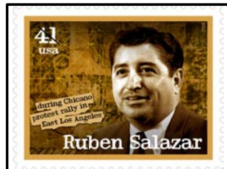
Ruben Salazar, pioneering journalist with the LA Times, to be commemorated at Tucson event