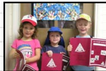
Preschoolers proudly pose with their first stamp albums