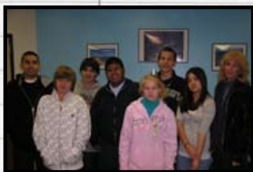
Orange Grove Middle School students worked on an exhibit for ARIPEX