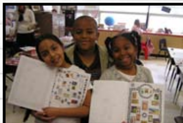
Tully 2nd graders eager to show off their albums