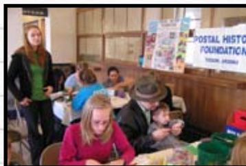
"Holiday Express" at the Train Depot