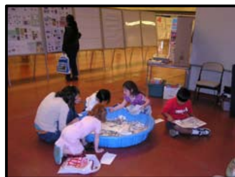
Kids enjoy the stamp pool at the ARIPEX Youth Area