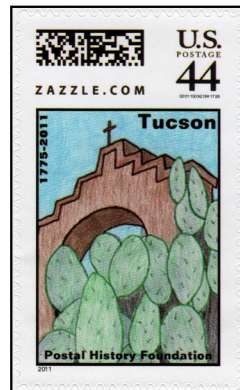
2011 Winning Design