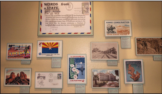
Enlarged stamps and postcards are used to help define Arizona’s history