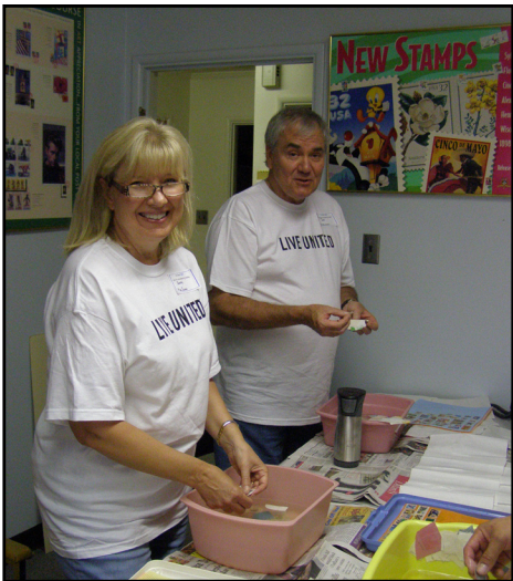
Happiness is soaking stamps