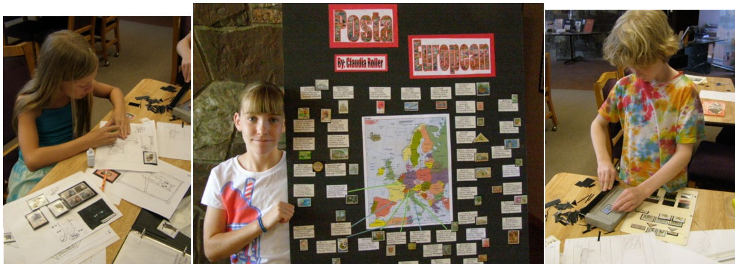
Campers working on their projects during stamp camp

Philatelic fun is the name of the game at the PHF stamp camps. From beginner to advanced, days flew by as campers learned basics such as how to soak stamps, how to use perforation gauges and tongs, and how to use a stamp catalogue. Super Campers, some of whom have attended for four years, worked on individual projects designed to increase their love of philately and at the same time build on their academic learning and skills. These projects are designed to appeal to students' interests, push philately outside the box, and make it more relevant to the individual youth collectors and their academic talents. Some campers created cartoon stories using stamps while others expanded their geographic knowledge by creating presentation boards about specific continents. Other students designed a series of cachets to coordinate with a U.S. Postal issue and created a topical exhibit collection. If you attend ARIPEX 2013 you will see these colorful and imaginative projects in the youth area.