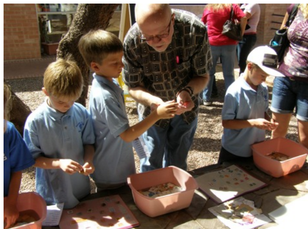
Students soaking stamps during a field trip

Donations of stamps, collections, supplies, and all the other philatelic materials that we use in our work with Youth Philatelists continue to arrive in a regular stream. Thanks to all of you who have been part of this effort. The National Postal Museum at the Smithsonian continues to be one of many wonderful partners in our philatelic educational efforts as more teachers who visit the museum learn about our YES program and use PHF lessons and stamps in their classrooms. As the demand for lessons and stamps increases, our need of stamps and philatelic materials is the highest it has ever been. In the past year we have supplied over 500,000 stamps to youth across our country. Please spread the word that we need philatelic supplies, stamps, and covers as we continue to support the 10,000 plus teachers and students in Arizona, the United States, and the world that use our program. Teachers and students enjoy using and integrating philately into the classroom curriculum. Continue to spread the word and support the future of philately. Thank you for your continued support and keep the donations coming!