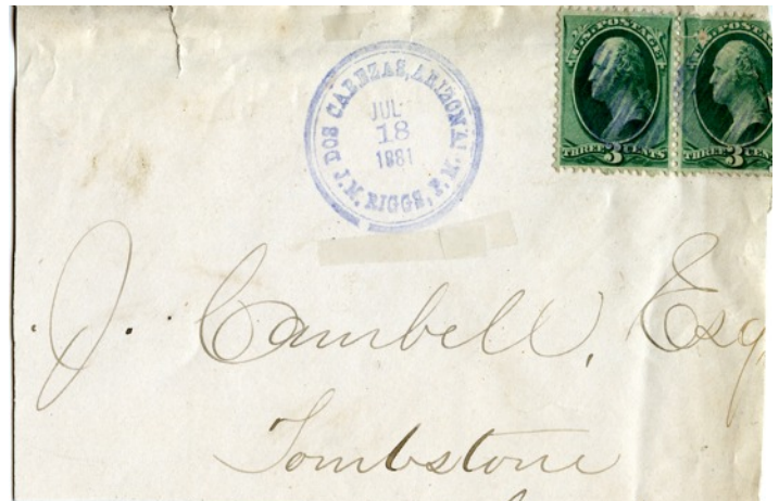
Note the postmaster's name on the cancel.