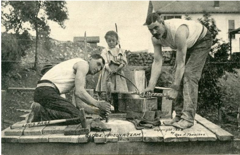
Promotional postcard from Globe, Arizona

Gold fever lured countless men and women west in the hopes they might strike it rich. It was often a lonely, difficult existence. One of the bright spots was a piece of news from back home. Did you ever wonder how these miners, often holed up in remote areas, refusing to leave their claim, could send and receive mail? The mail's journey from the eastern U.S. to the miners' grubby, calloused hands was long, complicated, and fraught with danger.