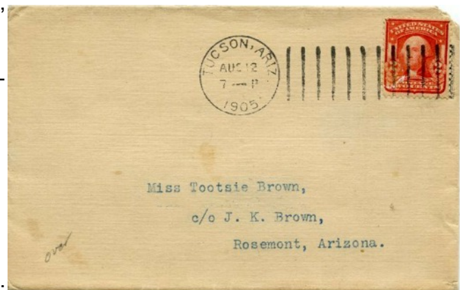
1905 cover from AZ Territory Covers Collection