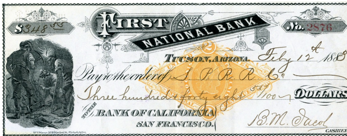
RN-G1 imprinted revenue stamp

One check, from the First National Bank of Tucson, has a 2 cent orange RN-G1 imprinted revenue stamp in the middle. The use of stamped paper for checks and other financial instruments was first authorized during the Civil War, and the 2 cent tax on checks and sight drafts expired on July 1, 1883. This check was written February 12, 1883, not long before that expiration. The tax was reinstated to raise funds for the Spanish-American War in 1898 and ran for a while. Scott lists these imprinted