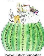
Happy Birthday Tucson 1775-2018