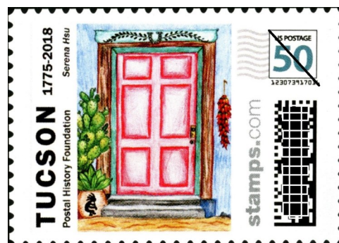
2018 Tucson Birthday Stamp

This year's stamp has proved to be very popular, along with the cachets and postmark. The custom U.S. postage stamp sells for $1.50, and the envelopes with cachets sell for 50¢ each. The collectible set is $2.00. The funds raised are used to continue the educational goals of the foundation. To purchase visit www.postalhistoryfoundation.org to print