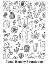
Happy Birthday Tucson 1775-2018