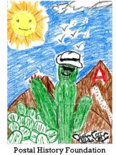
Happy Birthday Tucson 1775-2018