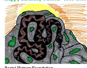
Happy Birthday Tucson 1775-2018