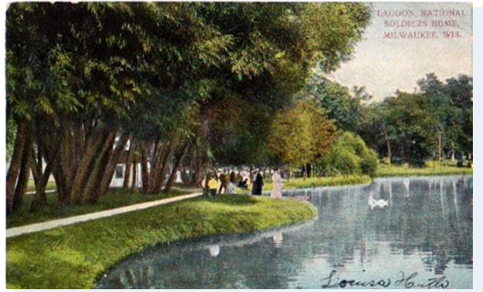
Circa 1904 postcard of National Soldiers Home in Milwaukee, Wisconsin.