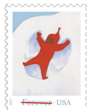
From the United States Postal Service's 2017 The Snowy Day set.

Everything's a Story runs through May 2019 in the Stusser Library. Library hours are Monday-Friday, 9-3. Please consult the online schedule or call ahead to be sure the library is not closed for reservation.