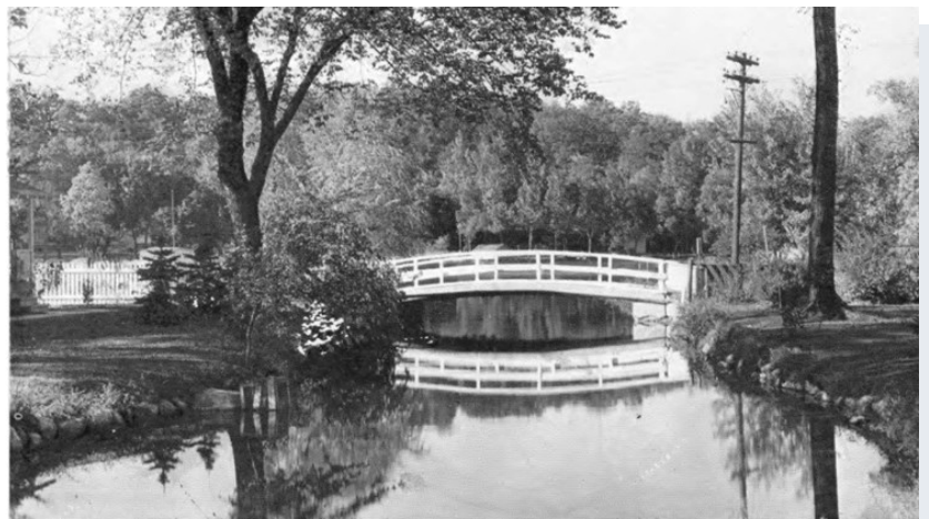
Postcard of Twin Lakes, Wisconsin, circa 1920.

Ancestry research is fun, relaxing, and certainly a conversation starter. You will inevitably discover someone in your tree that you will want to brag about, while at times you may uncover some less than stellar characters. My Bohemian and Irish ancestors, who worked on the farms and in the logging