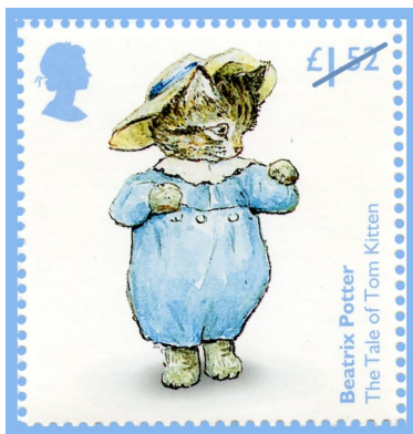
From Great Britain's Royal Mail 2016 Beatrix Potter set.

The library's first exhibit of 2019, Everything's a Story , features children's literature on postage stamps. Postal authorities around the world recognize the importance of children's books and have celebrated some of the most beloved stories on postage stamps. The stamps in this exhibition were selected because they would be most familiar to the Postal History Foundation's typical audience: Winnie-the-Pooh, Peter Rabbit and friends, Peter Pan , Alice in Wonderland , Harry Potter , Charlotte's Web , The Snowy Day , and The Very Hungry Caterpillar , to name a few. The exhibit showcases colorful stamps primarily from Great Britain and the United States, along with stamp production information, historical context, and quotations from the stories.