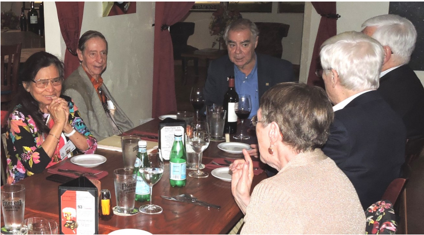
Some of the attendees at the banquet enjoying fine conversation during the evening.

As the show opened on Friday, there was considerable general media attention, due to the release of the Cactus Flowers stamp booklet. During the day, of course, many Rangers in attendance at the show wore their stars in support of youth philately, which never fails to elicit inquiries about who all these folks are at the show who are wearing a star.