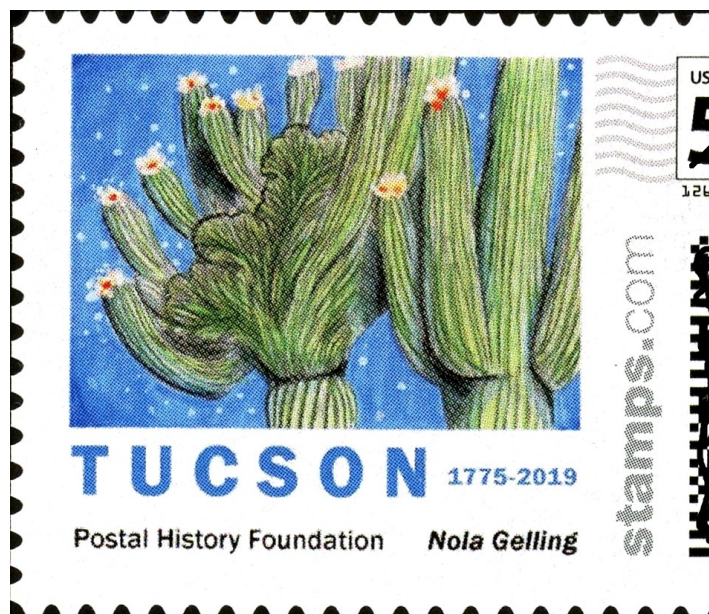
The 2019 Tucson Birthday Stamp