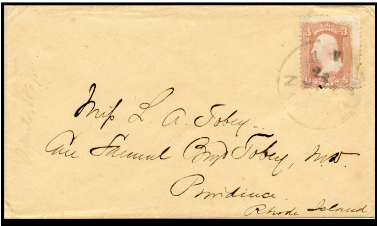
Tucson, Arizona Territory cover dated 1867.

What about other, less traditional approaches? What if postal history included the story of the people sending and receiving the cover?