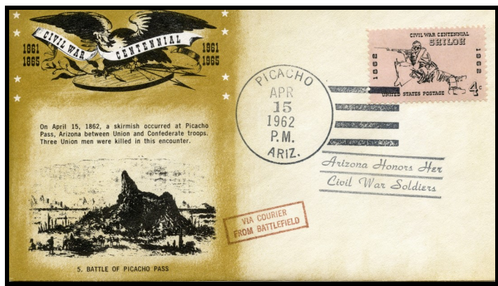
Picacho Peak centennial commemorative cover produced by the Arizona Civil War Centennial Commission in Tucson, AZ