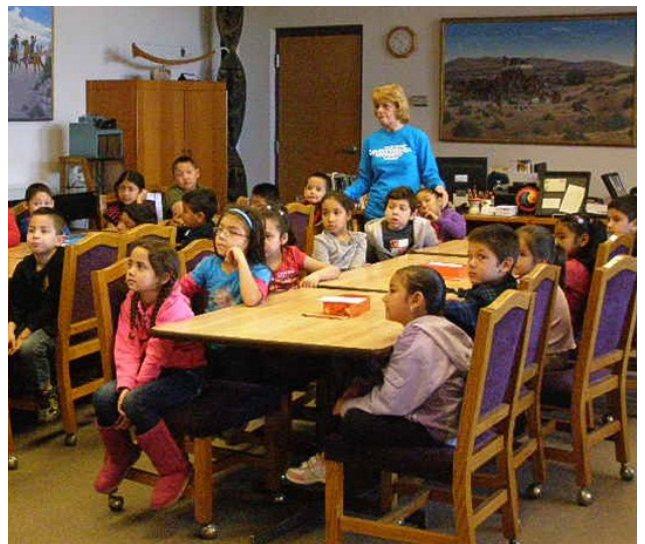
Students attending a field trip in the Slusser Library.

P.S. If you haven't renewed, please do so!