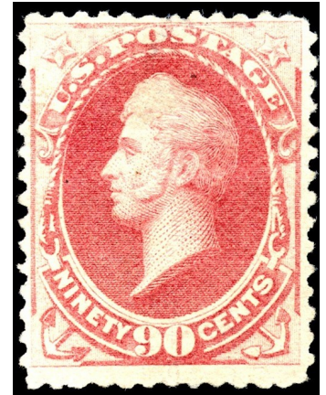
Oliver Hazard Perry Large Bank Note Stamp